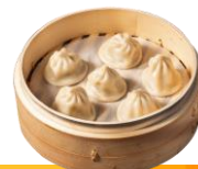
Mini Juicy Bun