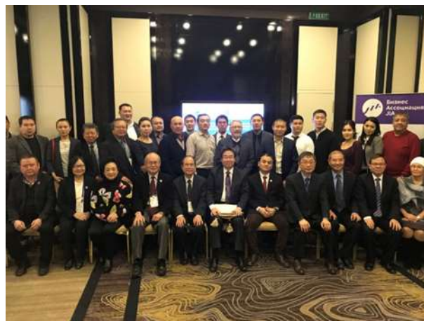
Kyrgyzstan -Taiwan Business Forum Group Photo