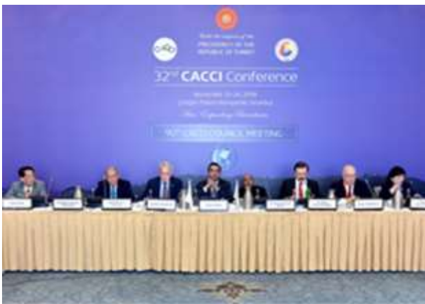
The 90th Council Meeting of the 32nd CACCI Conference