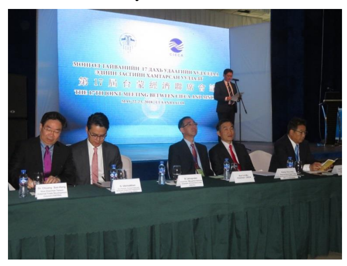
The 17<sup>th</sup> Joint Meeting between CIECA and MNCCI was held on May 23, 2018 at a Conference Hall of the MNCCI building, Ulaanbaatar

Sector Development and Smart City Initiatives in Mongolia". After the meeting, Taiwan's delegation also made courtesy calls on Mongolia's most famous companies, included Khaan Khuns Co., Ltd., Mungun Guur Hospital, APU Company and Gobi Cashmere Factory.