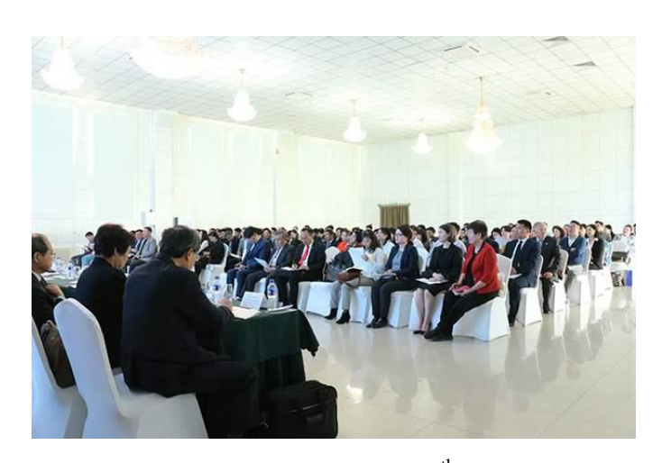
The opening ceremony of the 17<sup>th</sup> Joint Meeting between CIECA and MNCCI on May 23, 2018