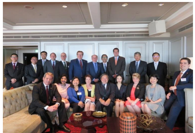
Group photo of the Luncheon for the Canadian Parliamentary Delegation