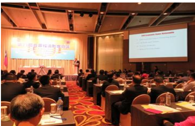
The 23rd Joint Meeting of CPBC & PCBC

CIECA will be co-hosting the 4th Taiwan-Portugal Joint Business Council along with Portugal's Association of Portuguese Entrepreneurs (AEP) at 14:00 on this coming November 21st, 2016, at the Shangri-La Far Eastern Plaza Hotel, Taipei. The agenda and interaction of