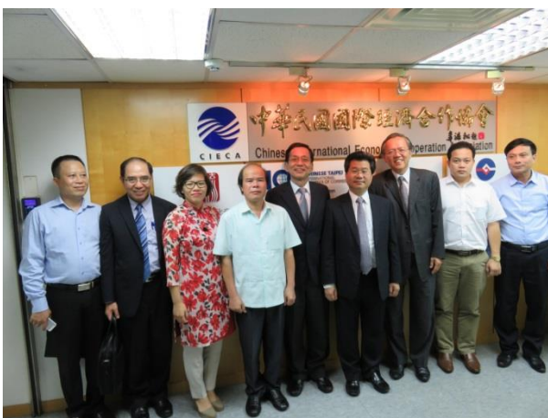
Vietnam Investment Promotion Delegation takes group photo at CIECA.