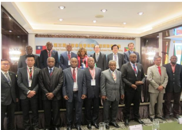
Group photo of the 3rd Taiwan - São Tomé and Príncipe JBC Meeting