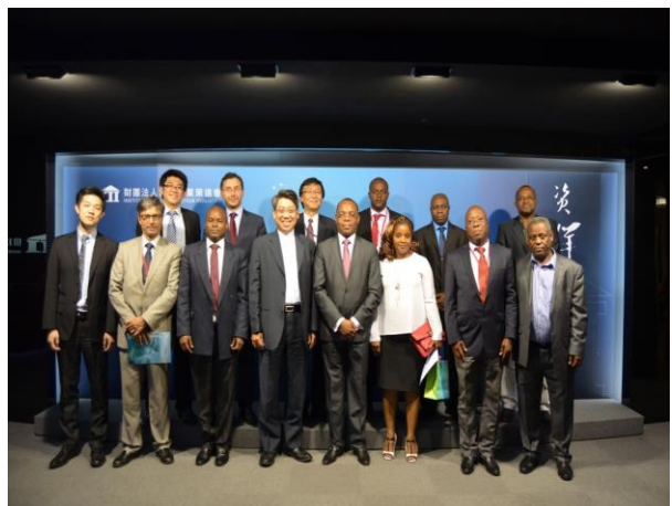
Called on Institute for Information Industry on April 22, 2016.