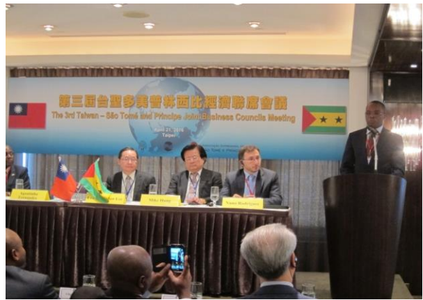
Special Remarks by Amb. Agostinho Quaresma dos Santos Afonso Fernandes, Minister of Economy and International Cooperation of the Democratic Republic of São Tomé and Príncipe

Various issues, namely “ICT Cooperation between the Government of Sao Tome and Taiwan”, “the Business Climate of São Tomé and Príncipe”, “International Tourism Promotion - Taking Taiwan as Example” and “São Tomé and Príncipe: Business Center for Central Africa and CPLP” were discussed. A total of 70 participants from Taiwan and São Tomé and Príncipe attended the meeting, and business networking was held in the afternoon on April 21, 2016.