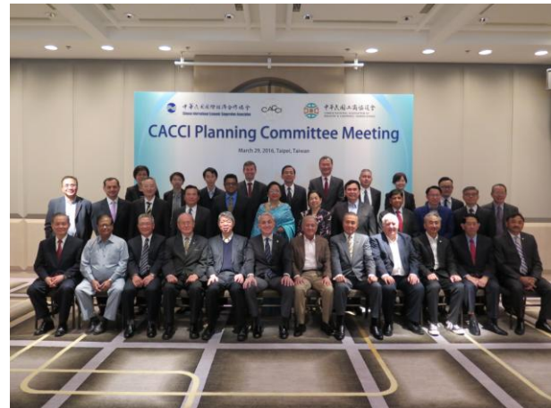
Group photo of CACCI Planning Committee Meeting

conference theme “The Rise of Asia: Taking a Bigger Role in the Global Economy” and topics as “Gaining Traction from Regional Economic Integration” ; “Promoting SME Development for Sustainable and Inclusive Growth” ; and “Tourism in the Asia-Pacific Region.” The event will be co-hosted by CIECA and the Chinese National Association of Industry and Commerce (CNAIC) and the major sponsor will be CTBC Bank.