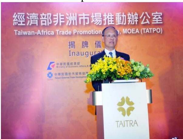
Mr. John Chen-Chung Deng, Minister of MOEA, chaired the Opening Ceremony of the “Taiwan-Africa Trade Promotion Office, MOEA”

The purpose of the office is to integrate all forces and strengthen our expansion into the African market, and the Taiwan External Trade Development Council will be responsible for implementation. It will initially focus on Morocco, Tanzania, Tunisia and Ethiopia as the potential new target markets, further will combine MOEA, CIECA, TAITRA, TAIDA and TABA develop integrated plans for expanding the African market that will be published in the annual report on APP, and to coordinate the resources of public associations to expand their benefits.