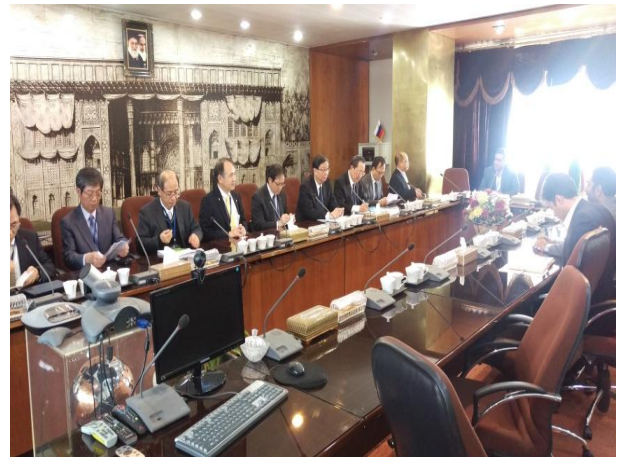
Called on Ministry of Economic Affairs & Finance