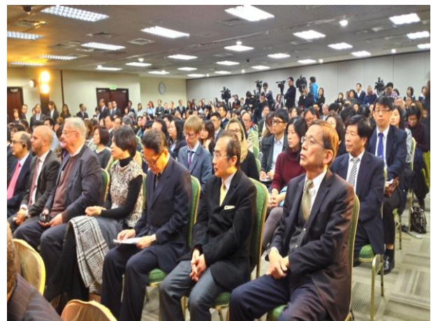
More than 200 guests attended the inauguration ceremony.