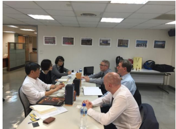
One-on-one Business Talks was held at 2 nd floor of CIECA