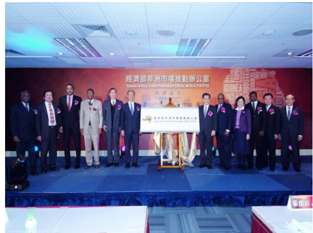
MOEA inaugurates the “Taiwan- Africa Trade Promotion Office, MOEA” in Taipei on March 14, 2016.