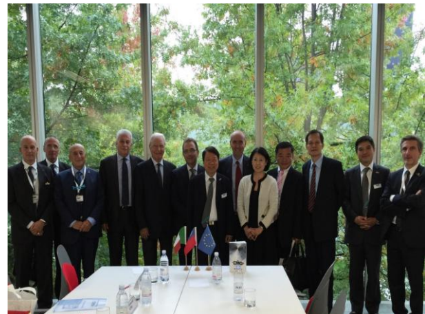
The economic and trade delegation visited Switzerland and Italy and called at the UCIMU-SISTEMI PER PRODURRE (association of Italian manufacturers of machine tools, robots and automation system).