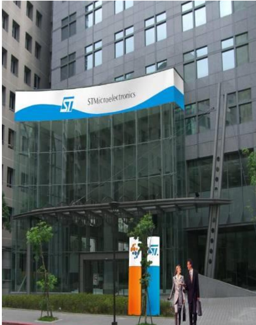
Jian Long Building Taipei

Site : Taipei (since 1984) Employees : 200 Focus : Computer Telecom Wireless Digital Consumer Industrial EMS Distribution Medical Operations : Sales & Marketing Competence Center R&D Lab Support Functions